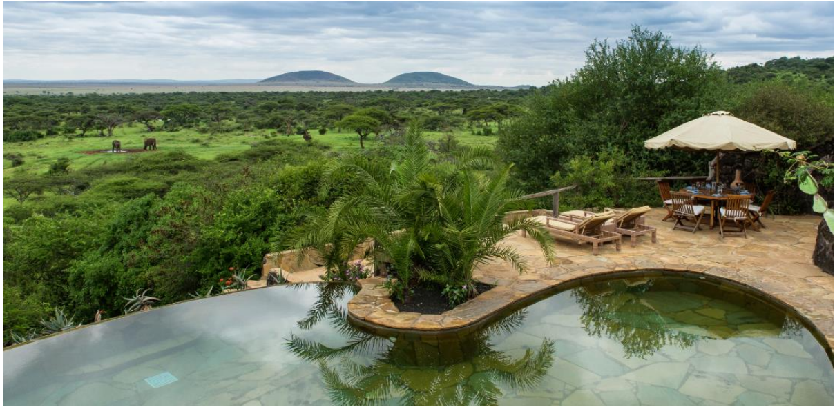
The pool area commands wonderful views over the landscape and local wildlife

With room for 20 guests, the sleeping accommodation is housed in 7 discreetly placed stone and thatch villas, which break down into 10 guest suites. Each villa of Ol Donyo Lodge is named, has its own architectural characteristics, and offers, by way of space, a slightly different living arrangement. Each is built to the highest of standards, is designed with an eye for both luxury and function. The bathrooms, for example, all contain stand-alone baths and most have star bed decking, private pools and outdoor showers.