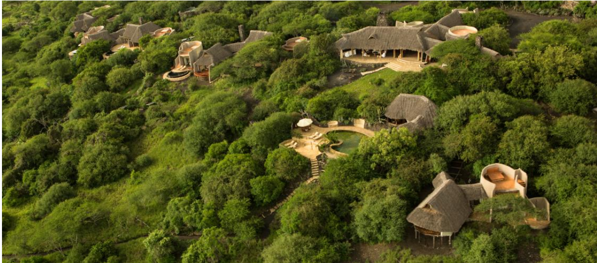
Oi Donyo from the air and the beautiful communal lounge and pool area, below

This morning, you will be transferred back to the Mara airstrip for your approximate 50 minute flight to the Chyulu Hills. Upon arrival you will be met and transferred by road to Oi Donyo Lodge for three night's stay on a full board basis.