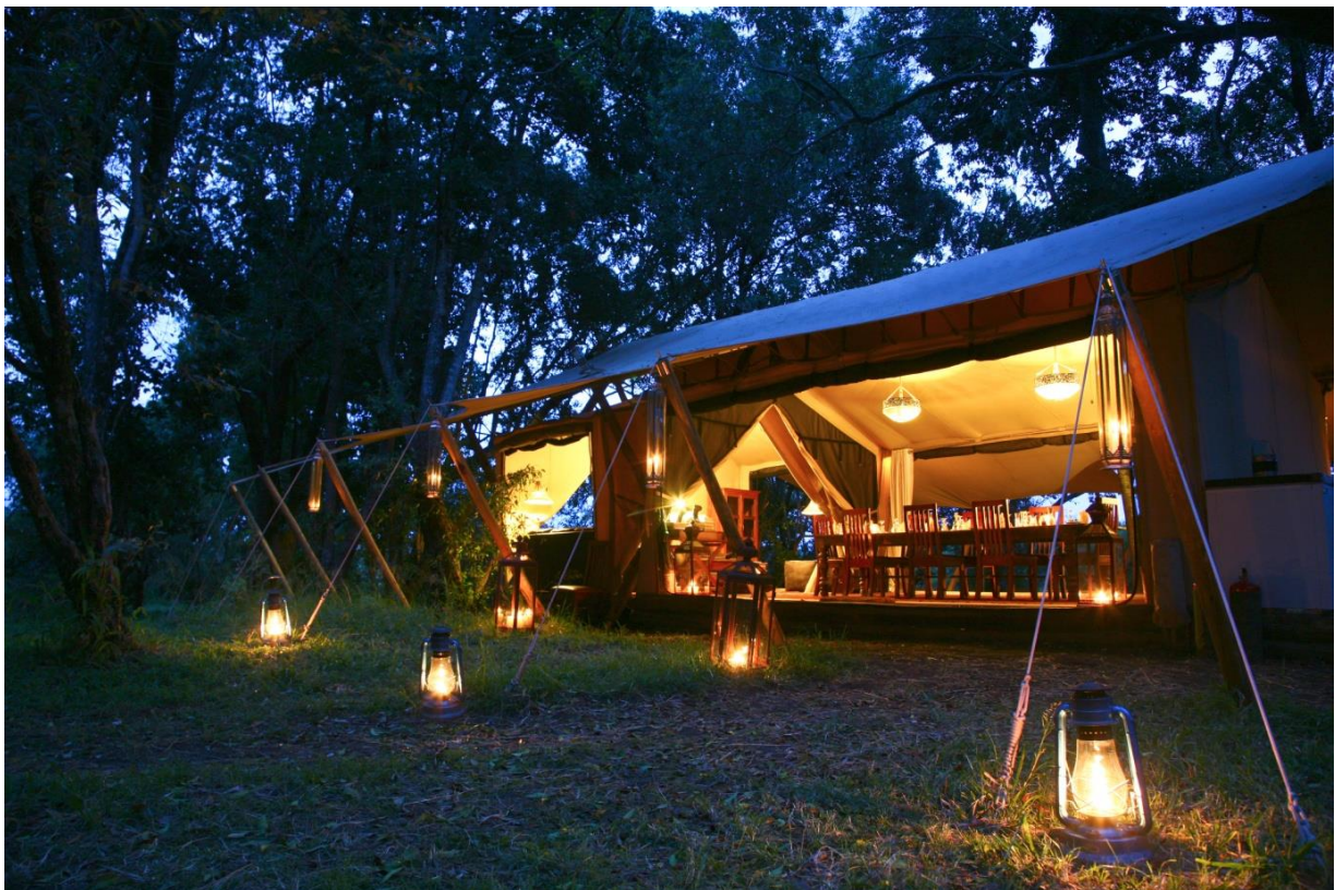
Typical design of the main mess tent

Mara Expedition Camp only opened in July last year. Lying just inside the north-central border of the Maasai Mara Game Reserve, it is an oasis surrounded by wildlife-rich savannahs and dense riverside forest. The camp is subtly placed, intended to be invisible to any passers-by.