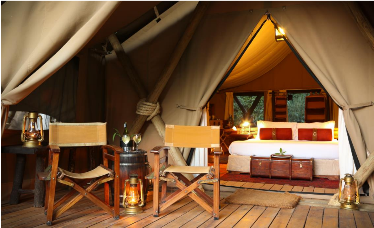
Your tent exterior