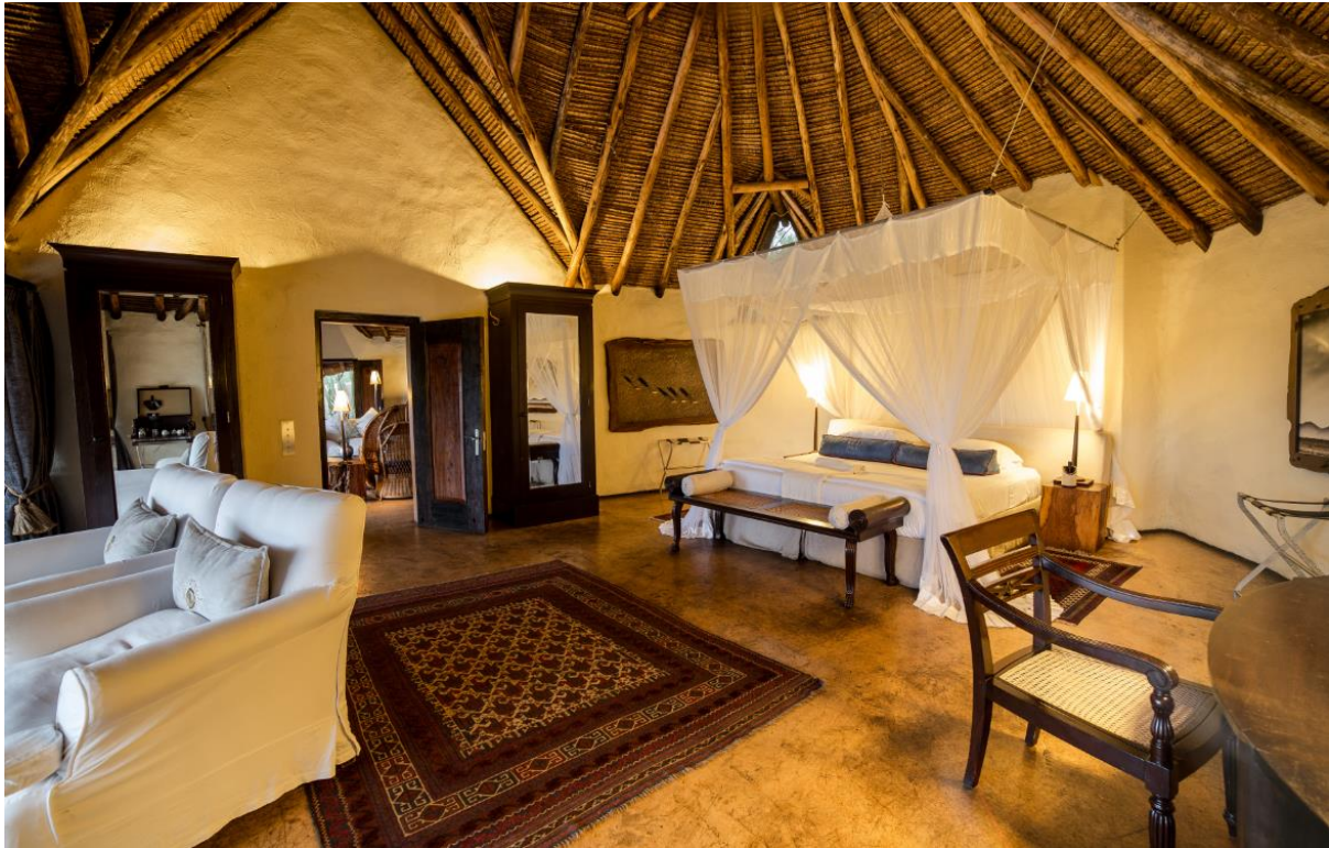
Your room interior and exterior