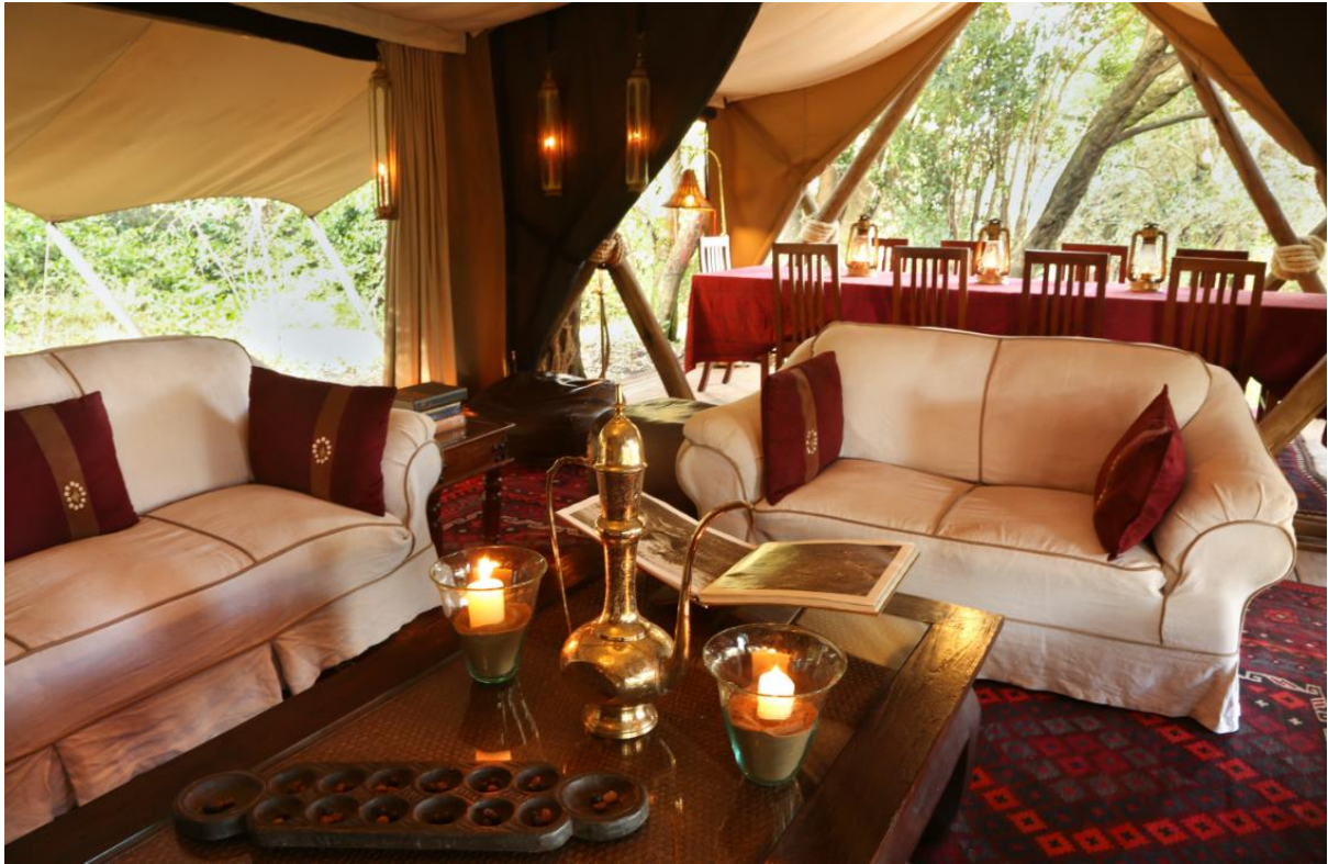
Interior and exterior of communal area