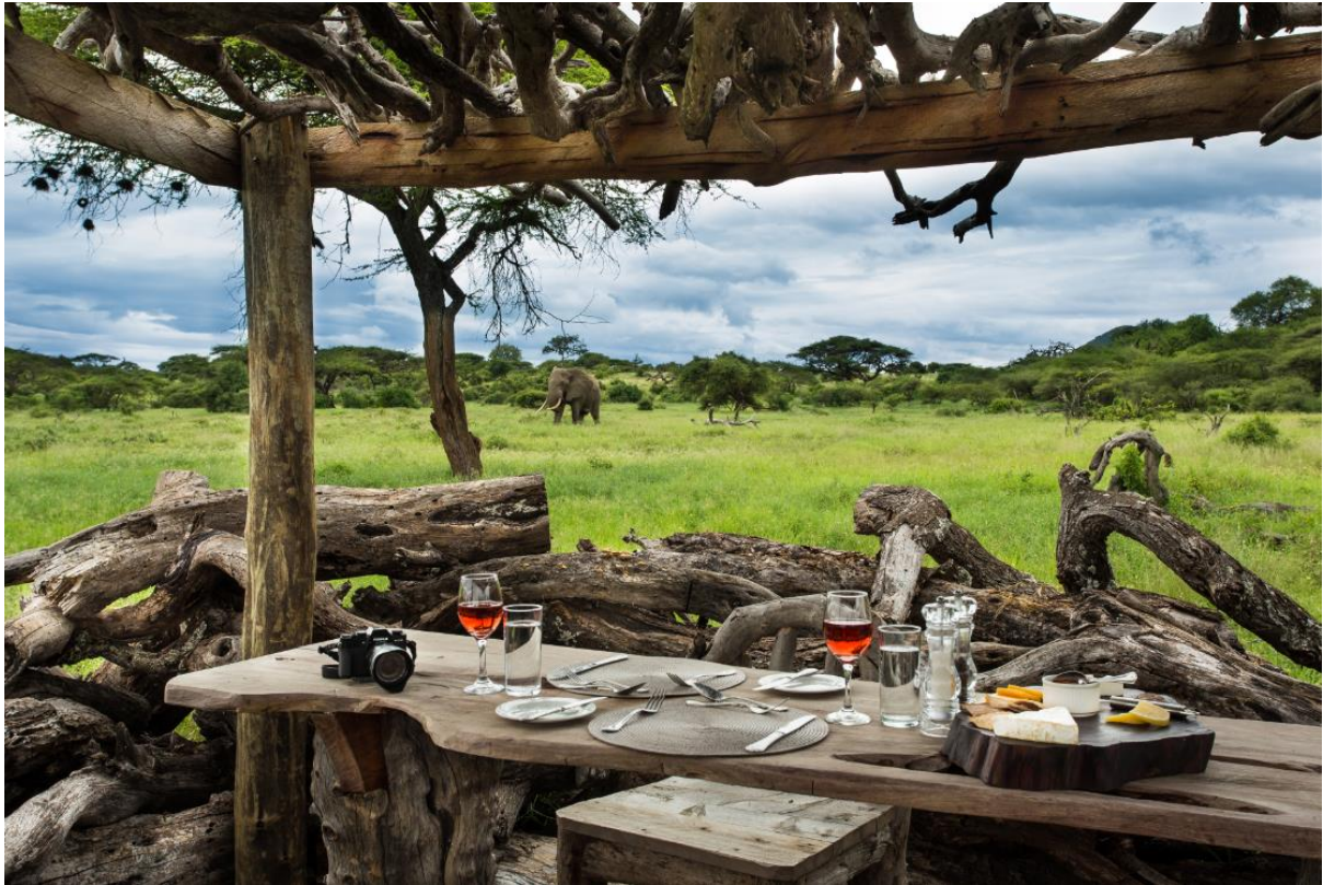
The Hide, where you can get up-close to the local wildlife, whilst enjoying lunch Below, stunning views of Mount Kilimanjaro while horse-riding