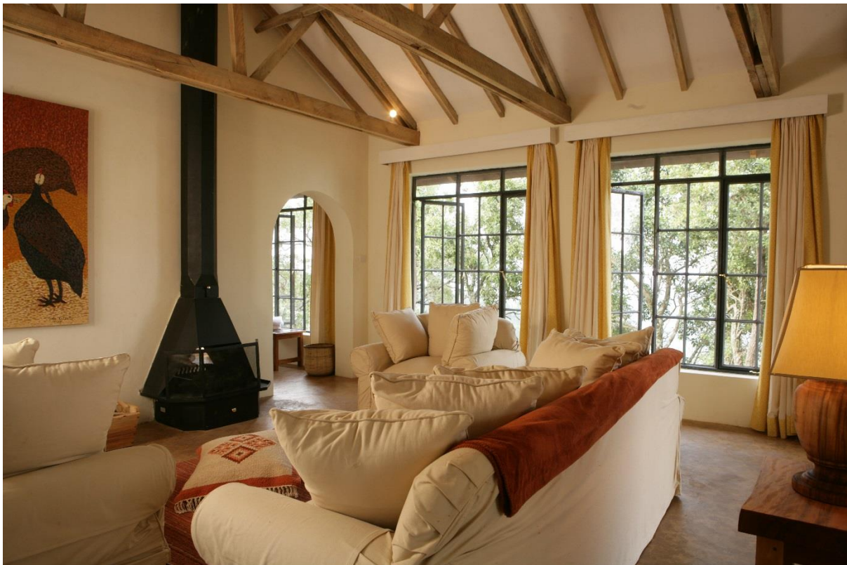
Main lounge at Clouds

French doors open out onto the balcony, the furniture - cream, sumptuous and low - is warm and comfortable, the walls are white and adorned with paintings commissioned from Ugandan artists. The overall feel, with only the giant rafters overhead, is one of great space. The cuisine is international and excellent, and the floor is headed up by Sipi, a head waiter and personal assistant known throughout Uganda for providing the highest standards of service.