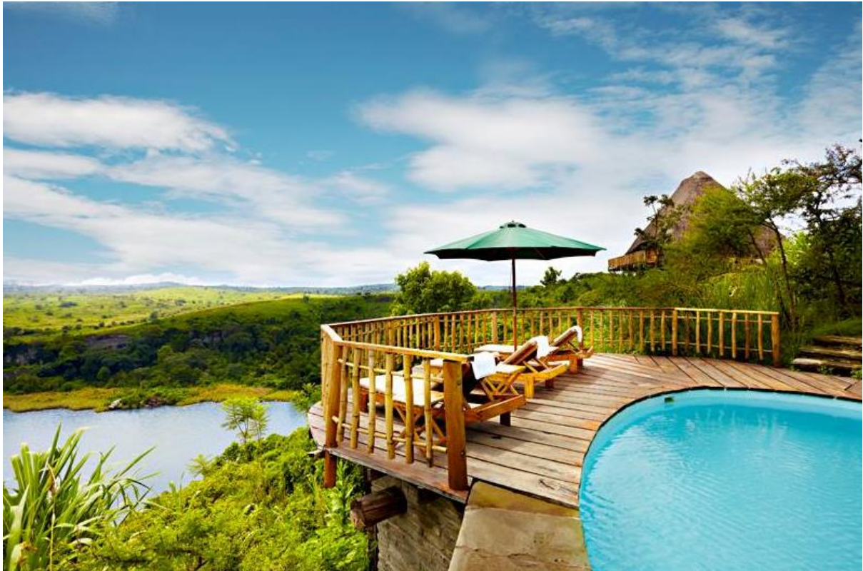
Lodge pool area and dining area, below