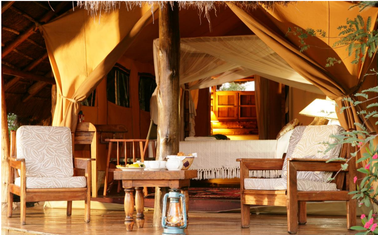
Tent interior and alfresco dining, below

Raised on wooden platforms, and protected by heavily thatched roofs, the sleeping tents of Semliki Safari Lodge are just as comfortable as the shared areas. Each tent possesses a separate bathroom, its own verandah, a double or twin bed, space to change in and a small seating area (easy chairs and small side table). Simply designed, tastefully decorated - Persian carpet, sensible furniture, polished floors, muslin curtains - and beautifully lit, the tents are comfortable and typically safari.