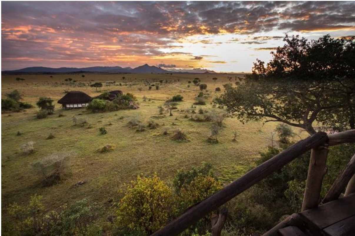
Semliki Lodge at sunset

Next we take you to Semliki National Park, where you will step back in time to the old explorer's world. You will stay at Semliki Lodge for two nights. This lovely secluded and intimate camp has excellent service, fantastic bird sightings and is historically very important as it was the first protected area in Uganda. You can take a wonderful boat trip on Lake Albert or set off to see the almost-prehistoric looking Shoebill; a fascinating giant of a bird. It will be a lovely ending to your adventures in Uganda.