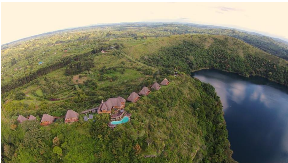
Aerial view of Kyaninga Lodge

From Clouds, we take you to Kibale Forest, where you will get to explore the wonders of this enchanted region with Chimpanzee trekking. Deep in the evergreen rainforest of Kibale, you will come face to face with man's closest living relative. Here you will stay at Kyaninga Lodge for two nights. Situated close to Kibale Forest, Kyaninga Lodge is the perfect place for you to explore this ancient wilderness.