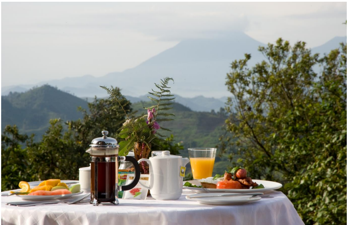
Your bathroom and beautiful breakfast views from Clouds