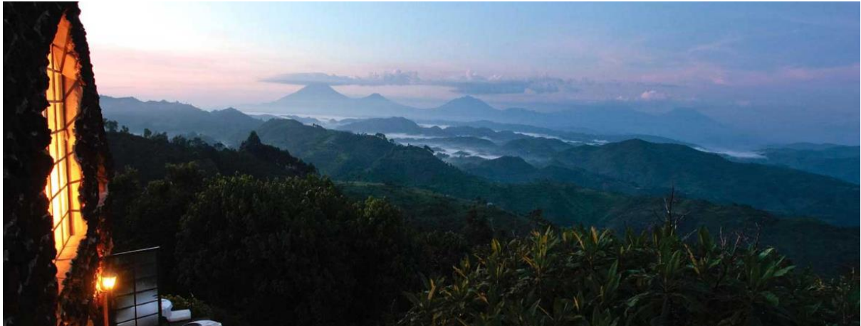
View from Clouds Lodge

From Clouds, we take you to Kibale Forest, where you will get to explore the wonders of this enchanted region with Chimpanzee trekking. Deep in the evergreen rainforest of Kibale, you will come face to face with man's closest living relative. Here you will stay at Kyaninga Lodge for two nights. Situated close to Kibale Forest, Kyaninga Lodge is the perfect place for you to explore this ancient wilderness.