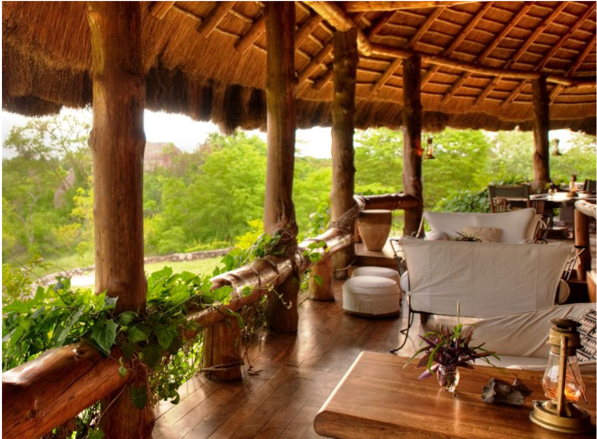
Lodge communal area and tented room below