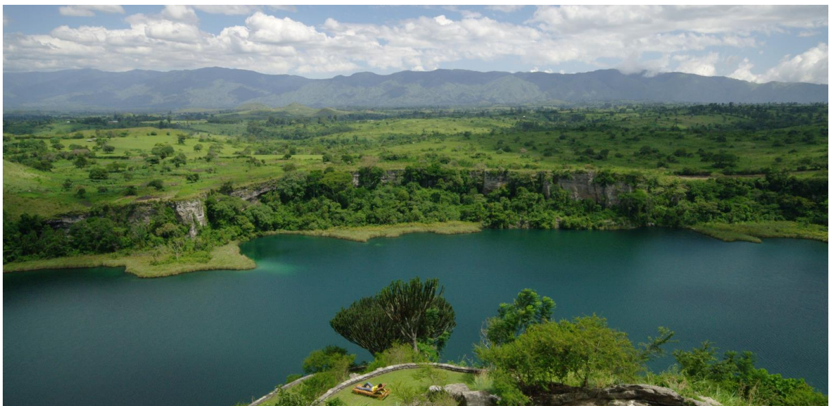
The views from Kyaninga Lodge are magnificent